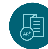
Augmented Reality (AR) Leaflet app