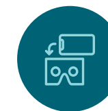
Virtual Reality (VR) Cardboard app